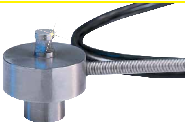
TQ201-100 shown actual size.