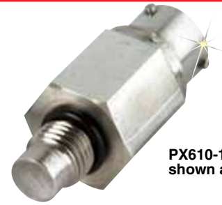
PX610-100GV, shown actual size.

Zero Balance: ±3.0% Operating Temperature Range: -54 to 121°C (-65 to 250°F) Compensated Temperature Range: 16 to 71°C (60 to 160°F) Thermal Zero Effect: ±0.01% FS/°F Thermal Span Effect: 0.036% FS/°C (± 0.02% full scale/°F) max Proof Pressure: 150% range Burst Pressure: The lesser of 400% range or 30,000 psi max Body Material: 17-4 PH stainless steel Diaphragm Material: 17-4 PH stainless steel O-Ring Size: 2-012, polyvinyl