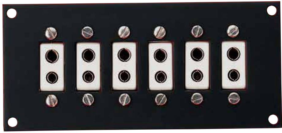
Shown smaller than actual size. All Omega™ NHJP jack panels are shipped unassembled

Omega high-temperature jack panels feature ceramic connectors mounted in a steel plate for service temperatures up to 538°C (1000°F). These panels with UHX connectors are ideal when glazed ceramic or nylon connector panels would contaminate a vacuum system.