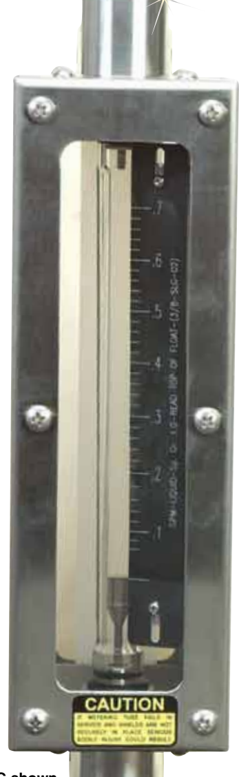
FL601G shown smaller than actual size.