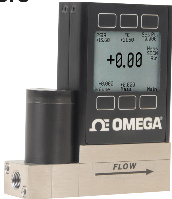
FMA-2601A shown smaller than actual size.

The controller uses a true proportional valve coupled to the flow body to control flow using the integral PID loop controller. Standard units include a 0 to 5 V output (4 to 20 mA optional) and RS232 communications. The gas-select feature and the setpoints can be adjusted from the front keypad or via RS232 communications. Volumetric flow, mass flow, absolute pressure, and temperature can all be viewed or recorded through the RS232 connection. It is also possible to multi-drop up to 26 units on the same serial connection to a distance of 46 m (150').