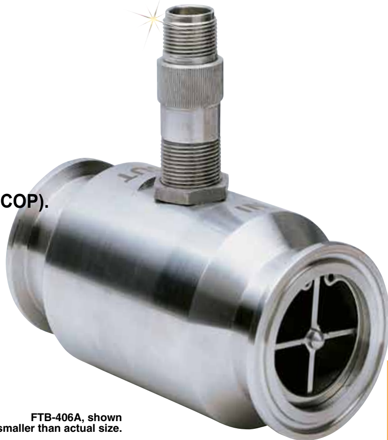
FTB-406A, shown smaller than actual size.

The Omega FTB400-Series Sanitary Design Turbine Flowmeter is designed and manufactured to be compliant with the ASME Bioprocessing Equipment Standard BPE-2019 for measurement of process liquids where high sanitary standards are required. ASME-BPE-2019 is the leading Standard on how to design and build equipment used in the production of biopharmaceuticals. This series includes 11 sizes, 1/4" to 3" with standard Tri-Clamp™ fittings, covering flow rates for 0.35 to 650 GPM.