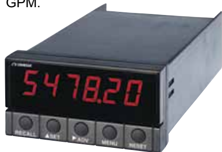
Use the FTB-400A Series turbine flow meter with the DPF701 Series flow indicator.