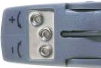
Detail of blade depth adjustment keys in bottom of stripping jaw.