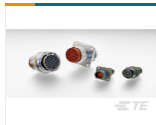
TE Part #YAFD54-12-10SNC127 RECP ASSY