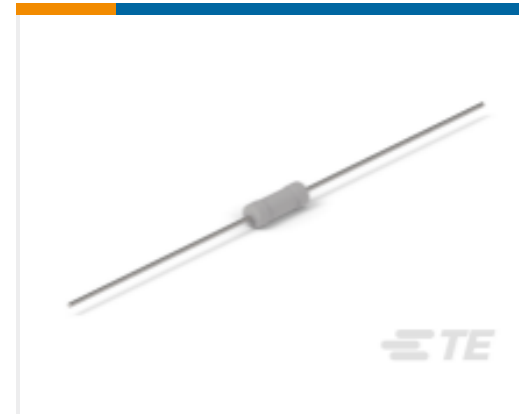
TE Part #7-1676123-9 1/2W SM M/OX 5% 1K5