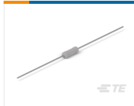
TE Part #7-1676123-7 1/2W SM M/OX 5% 1K2