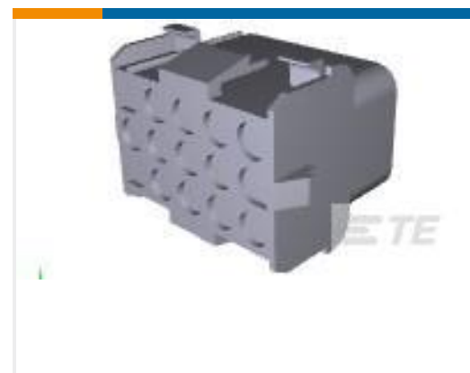
TE Part #926647-2 15P UN-MNL AUFN-GEH