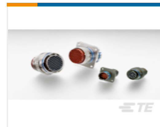
TE Part #YAFD57-12-10PNC127 PLUG ASSY