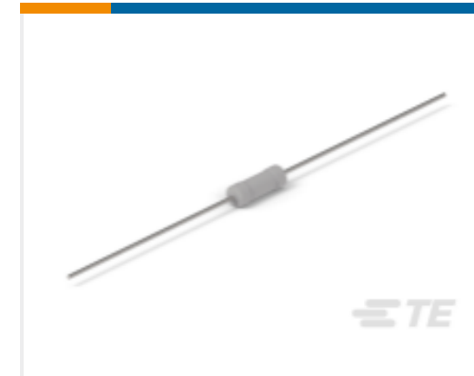
TE Part #6-1676123-0 1/2W SM M/OX 5% 240R