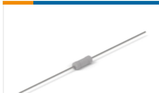
TE Part #7-1676123-9 1/2W SM M/OX 5% 1K5