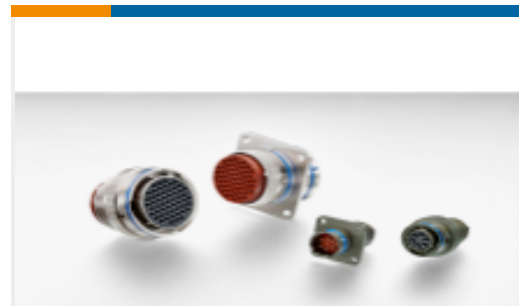
TE Part #YAFD57-12-10PNC127 PLUG ASSY