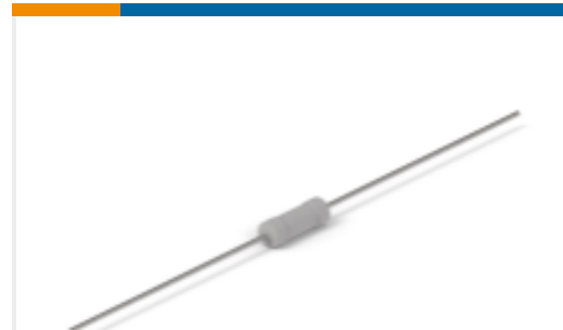
TE Part #6-1676123-0 1/2W SM M/OX 5% 240R