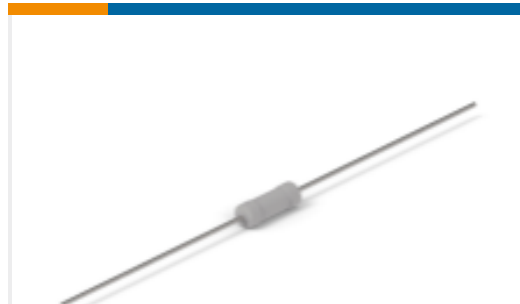
TE Part #7-1676123-7 1/2W SM M/OX 5% 1K2