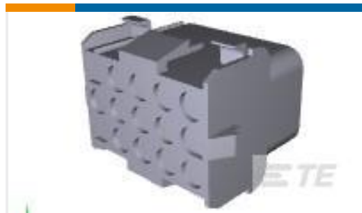
TE Part #926647-2 15P UN-MNL AUFN-GEH