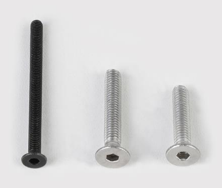
(M3*40)*1 (M4*25)*1 (M4*20)*3