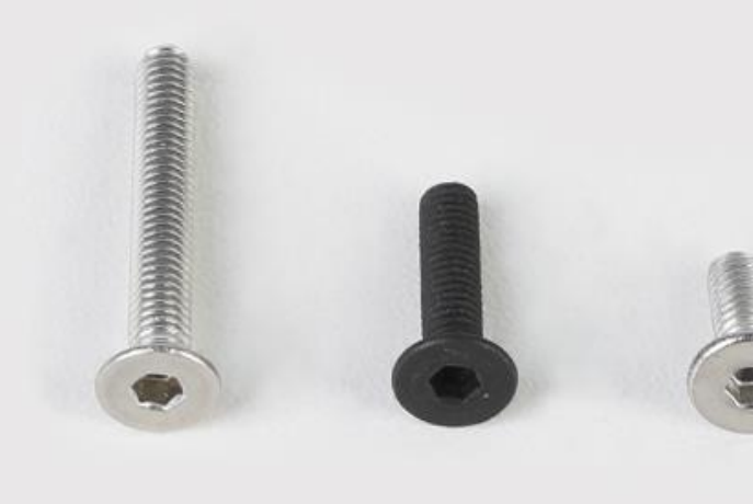
(M3*20)*1 (M3*12)*1 (M3*8)*1