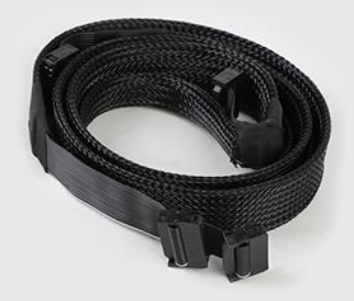
14+16P Flat cable L=1520/900mm