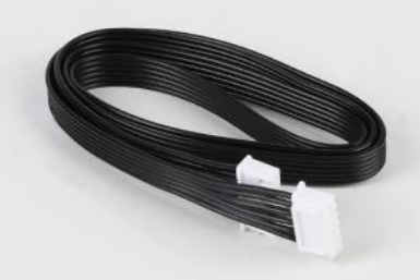
Display line L=650mm