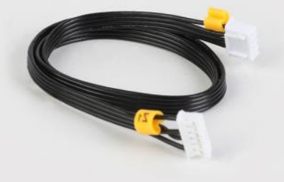
Z1 axis motor line L=430mm