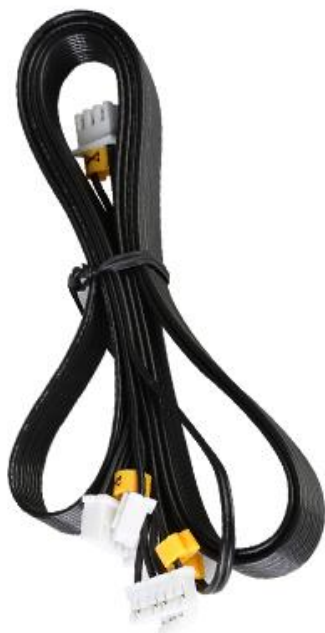
XE motor line X: L900mm Y: L1000mm