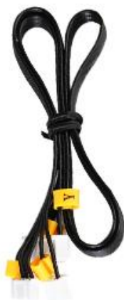
Y motor line L550mm