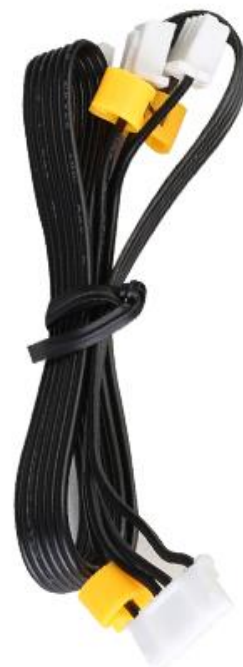
Z motor line L400mm