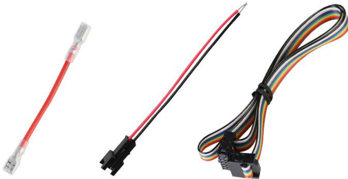
Power wire L90mm