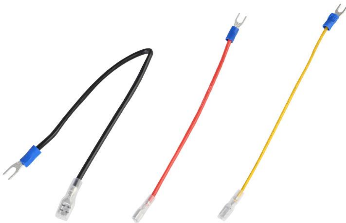
Power wire L200mm