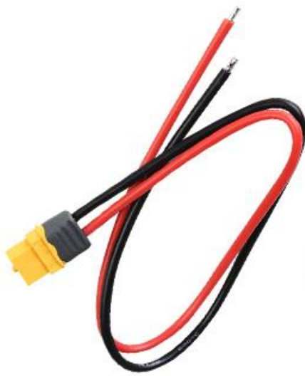
Power wire L350mm