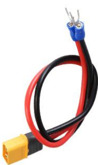
Power wire L300mm