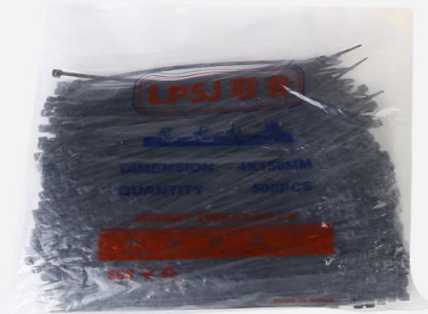
Black nylon cable tie*1