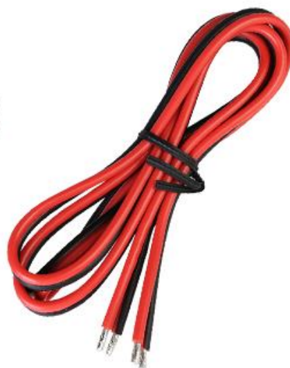
Hot bed wire L900mm