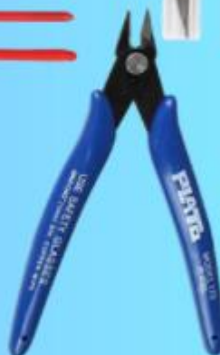
Tool Box Kit