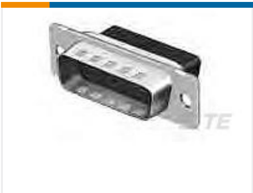
TE Part #5205208-1 CRIMP SNAP PLUG ASSY, 25 POS