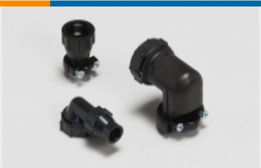
Unscreened Circular Connector Backshells & Clamps(56)