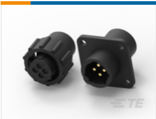
TE Part #211769-1 CPC SERIES 1