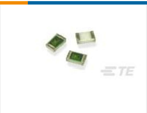
TE Part #2-1625868-9 RP 2A 0.25W 10R5 0.1% 25PPM 1K RL