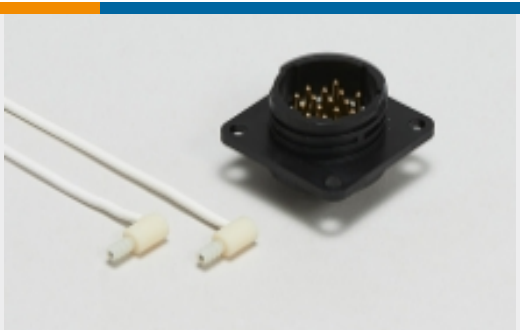
Circular Power Connectors(513)