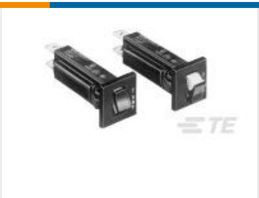
TE Part #4-1393250-3 W28-XQ1B-10=W28