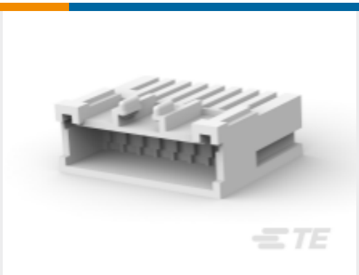
TE Part #5-316092-1 2.5 SIGNAL D/LOCK CAP HSG 8P (GWT)