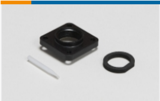
Circular Connector Seals(36)