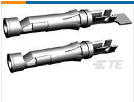
TE Part #66563-4 III+ SKT,24-20,30AU/FL,STRIP