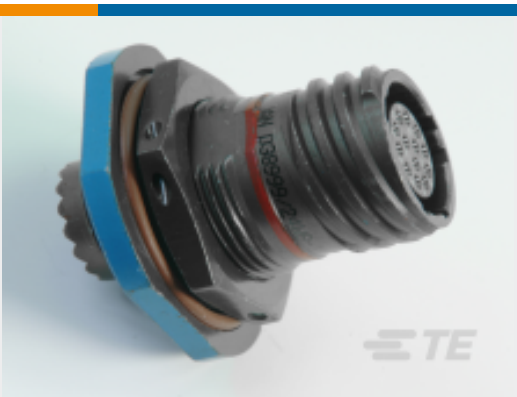
TE Part #YDTS24F25-61PCV001 RECP ASSY