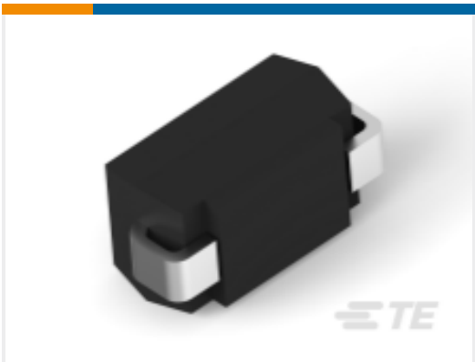
TE Part #1-2176322-8 SMV 1W 2M7 5%