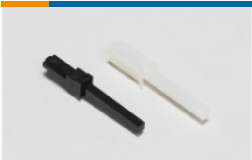
Circular Connector Keying Plugs(2)