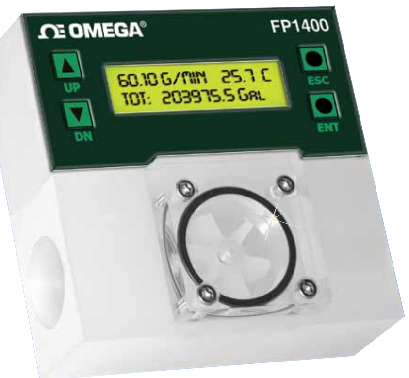
FP1408 shown larger than actual size.

FP1400 Series flowmeters support various functions including; two independently programmable flow totalizers, user programmable low, high or range flow and temperature alarm, two sets of user programmable optically isolated outputs, self diagnostic alarm, and flow pulse output. The flow rate can be displayed in 29 different volumetric or mass flow engineering units. Flowmeter parameters and functions can be programmed locally via optional key pad and LCD or remotely via the RS232/RS485 interface. Local 2 x 16 LCD readout with adjustable backlight provides flow rate, temperature, total volume reading in currently selected engineering units, diagnostic events indication and feature a password protected access to the process parameters to ensure against tampering or resetting.