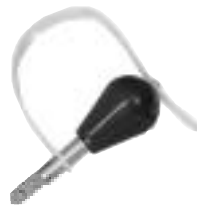
Universal Handle Part No. 465629-□*

Requires Installation Tip: Part Number 465468-1 (.185 [4.7] insul. dia. and/or crimp width) or Part No. 465488-1 (>.185 [4.7] insul. dia. and/or crimp width).