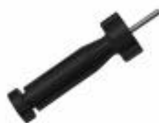
Extraction Tool Part No. 455822-2