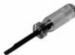
Extraction Tool Part No. 465644-1