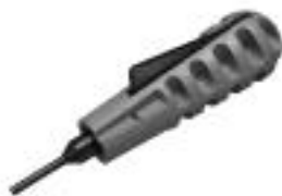
Extraction Tool Part No. 318851-1