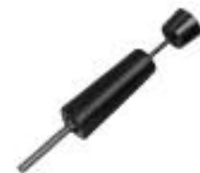
Extraction Tool Part No. 305183