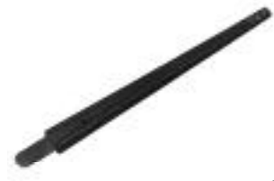
Extraction/Lance Reset Tool Part No. 843996-3