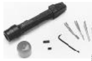
Insertion/Extraction Tool Part No. 91285-1