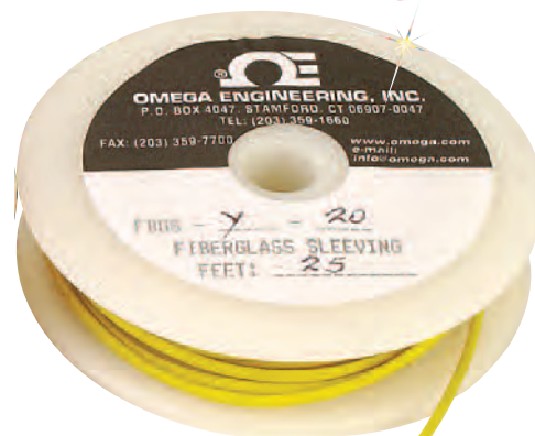
FBGS-Y-20-25, yellow 20 gage fiberglass sleeving

For More Sleeving Options, Visit omega.com/ sleeving