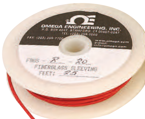
FBGS-R-20-25, red 20 gage fiberglass sleeving