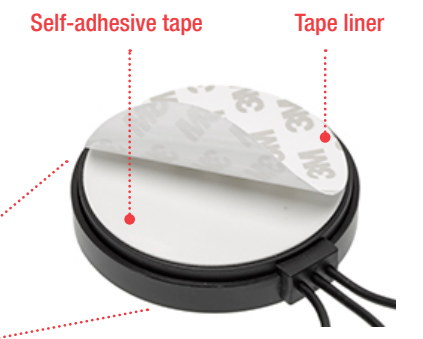
Flip-side of antenna housing

Enables space-efficiency and easy integration into applications requiring IP66 protection