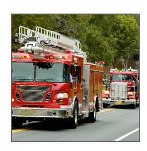
Fleet Management Systems for Commercial Vehicles