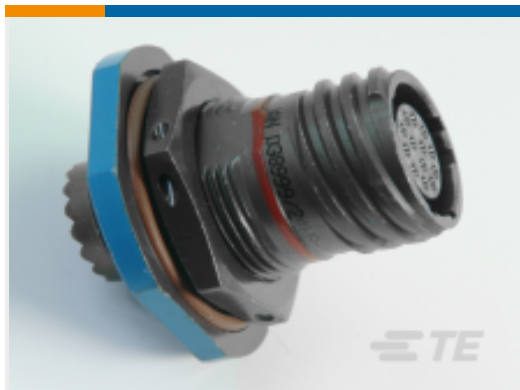
TE Part #YDTS24T15-18PNV001 RECP ASSY