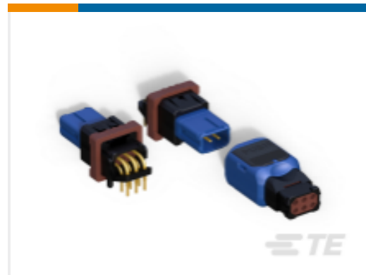
TE Part #YD369-B99-AP400000 369 9 WAY PANEL MNT REC, 90 PCB GOLD,PIN