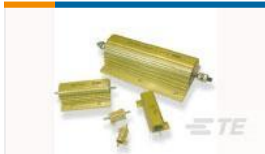
TE Part #1-1630019-4 HSC200 2K4 5%