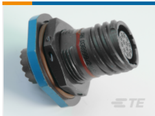
TE Part #YDTS24T21-35SNV001 RECP ASSY