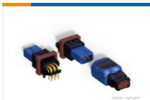
TE Part #YD369-B99-NS400000 369 9 WAY PANEL MNT REC, 90 PCB GOLD,SKT