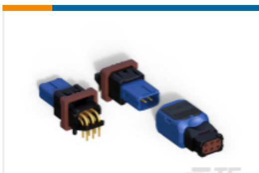
TE Part #YD369-B99-NP400000 369 9 WAY PANEL MNT REC, 90 PCB GOLD,PIN