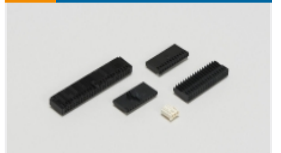
Wire-to-Board Connector Assemblies & Housings(139)