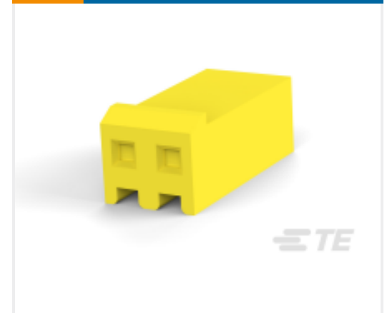
TE Part #644267-2 SL156 HSG (YELLOW)