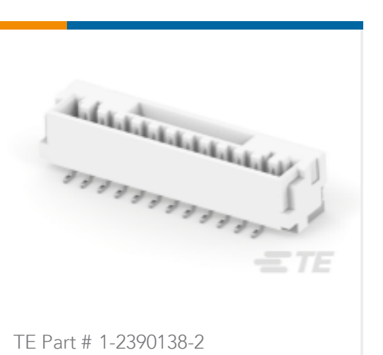
1.25P 12POS WTB VERT BRD W LATCH TIN NA