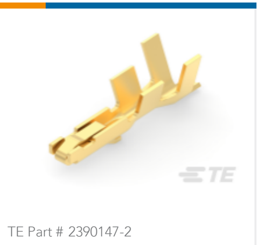
1.25P WTB CABLE CNT AU