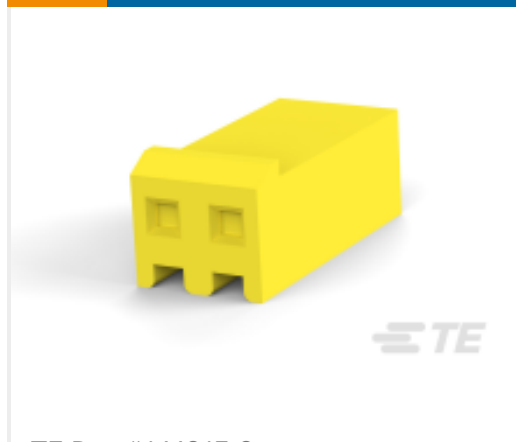
TE Part #644267-2 SL156 HSG (YELLOW)