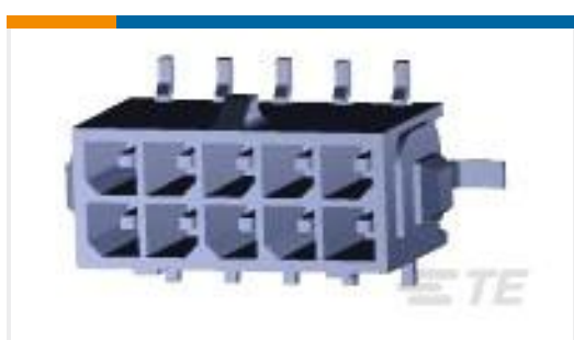
TE Part #4-794638-0 10P MICRO MNL ASSY,VRT,SMT,LF