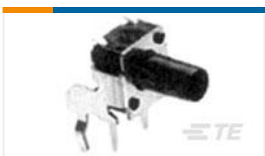
TE Part #1825027-8 FSMRA3JH04=R/A,TACT PB SW,160G