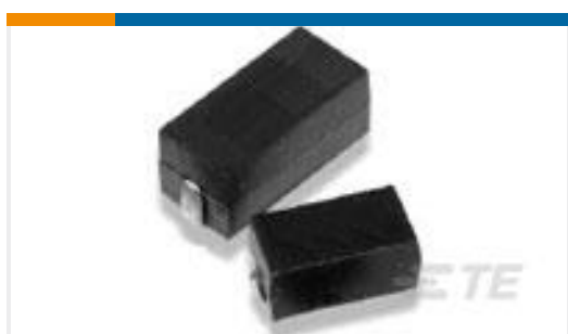
TE Part #6-1879233-8 SMW5 62R 5%