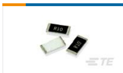
TE Part #2176054-2 RLP73M 2A R056 5% 5K RL