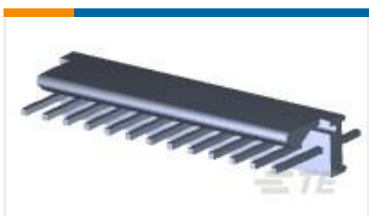
TE Part #4-641126-3 13P MTA100 HDR ASY FL/STR LF