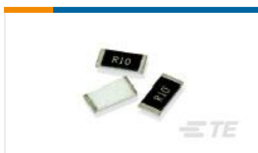
TE Part #2-1622824-4 RL73H 2H R22 1% 4K RL