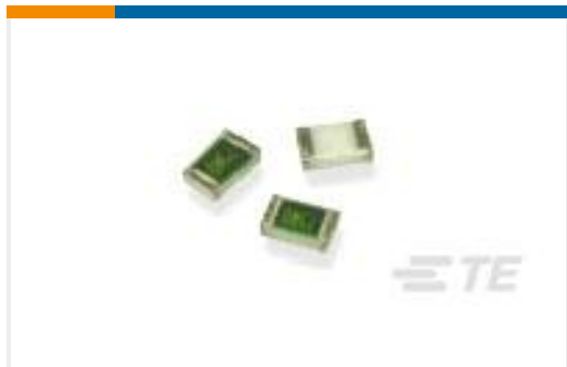
TE Part #1676261-2 RN 0805 23K2 0.1% 10PPM 1KRL