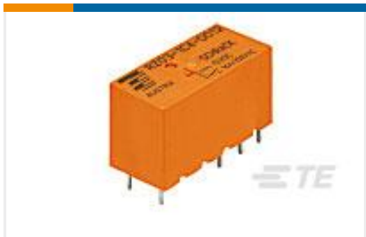
TE Part #2-1415899-3 RZ03-1C4-D024