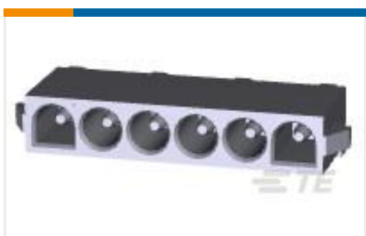
TE Part #641831-1 06P UMNL PIN HDR ASSY 94VO