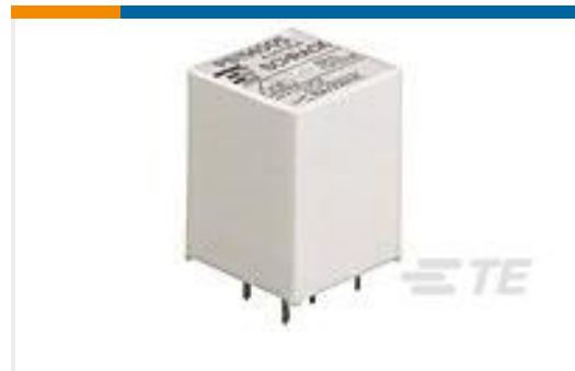
TE Part #9-1415029-1 PB114024