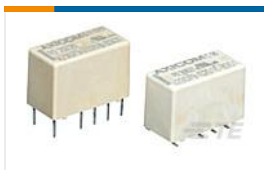
TE Part #1-1393788-1 V23079A1003B301