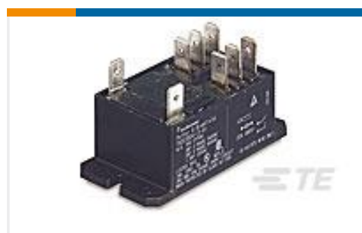
TE Part #9-1393211-0 T92S11D12-24