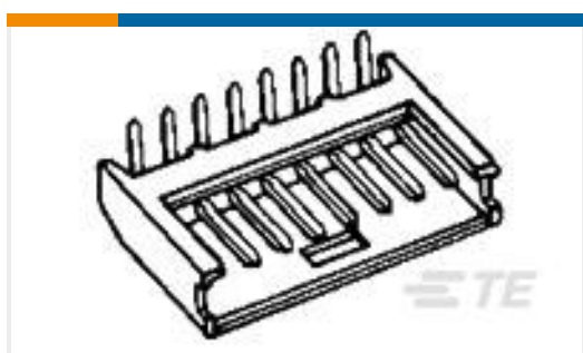
TE Part #280380-1 8P AMPMODU II SHRD HDR, RT ANG, TIN