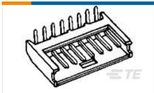
TE Part #280381-1 10P MODU II SHRD HDR, RT ANG, TIN