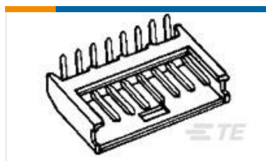
TE Part #280377-2 2P MODU II SHRD HDR,RT ANG, 0.38 AU