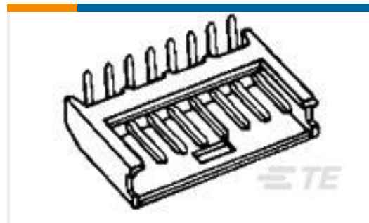
TE Part #280378-2 4P MODU II SHRD HDR, RT ANG, 0.38 AU