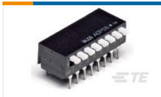
TE Part #1-1571999-6 ADP0604=PIANO DIP SWITCH