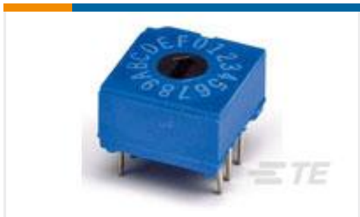
TE Part #1-1825007-1 DRD16CE04=ROT DIP,16P