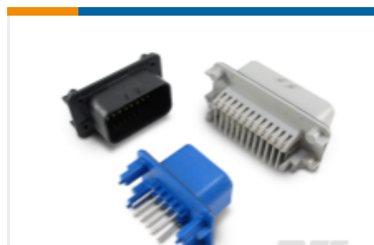
TE Part #1-776231-1 AMPSEAL PCB Headers