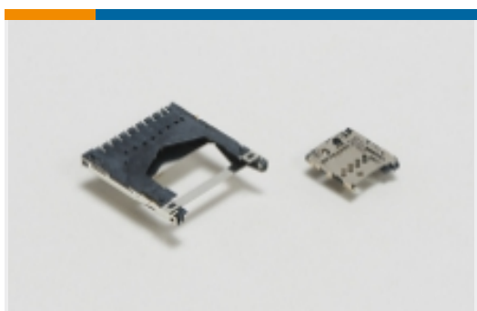
SD Card Connectors(1)