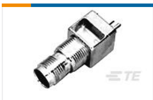
TE Part #5227835-1 TNC PCB VERT JACK W/POST