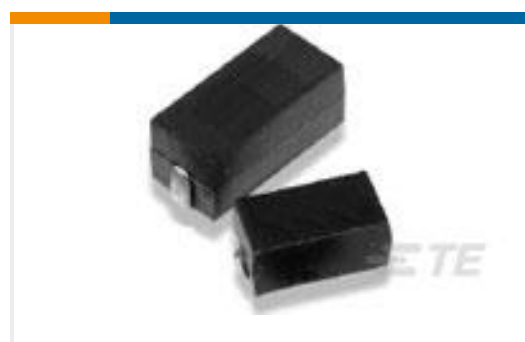
TE Part #3-1879233-5 SMW5 2R7 5%