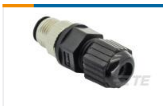
TE Part #1838275-4 M12 Fld Ser CONN. Male Pin Sldr