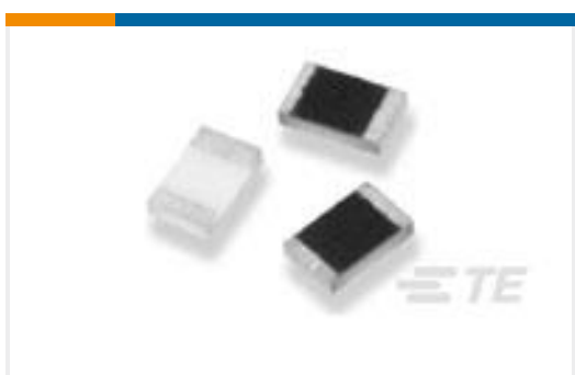
TE Part #6-1624108-9 3640 0402 17nH 2% 1K RL