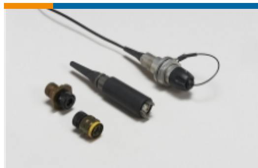
Expanded Beam Fiber Optics(9)