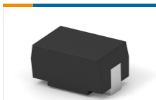
TE Part #1-1879011-1 SMD Power Resistor: 7 Watt, 200-2M Ohm