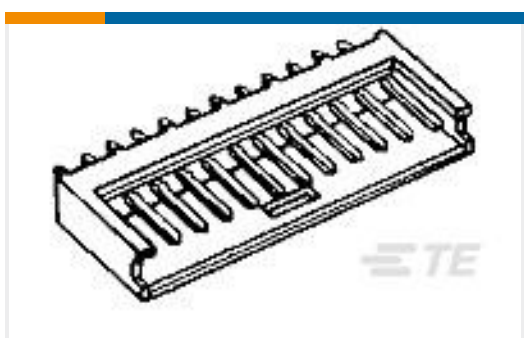
TE Part #280374-1 10P AMPMODU II SHRD HDR, ST, TIN