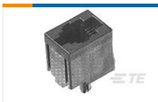
TE Part #5520258-3 M/JTOP6P/6CPNL STOPSTRAY P