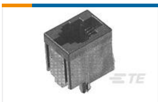
TE Part #5520259-4 M/J,TE,8P,TRAYS