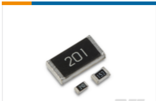
TE Part #1-2176331-3 CRGP 2512 100R 1%