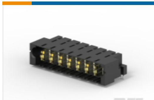
TE Part #6450833-7 MBXLE R/A HDR 7ACP