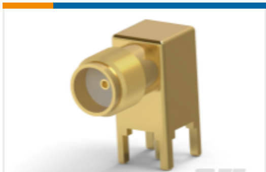
TE Part #5-1814400-2 SMA R/A PCB Skt GZD