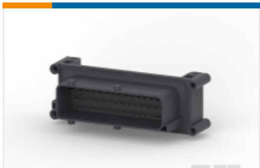
TE Part #2-963224-1 42P MESSERLEIST MIX