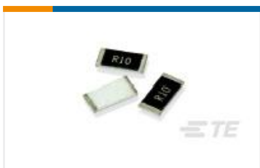
TE Part #7-1622825-6 RL73K 2E R10 5% 5K RL