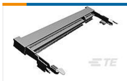
TE Part #1473005-4 SEMI-HARD TRAY DDR2 SODIMM SOCKET 200P 5