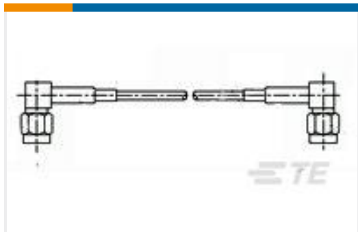
TE Part #1337812-1 50 OHM COAX SMA ELB PLUG ELB P