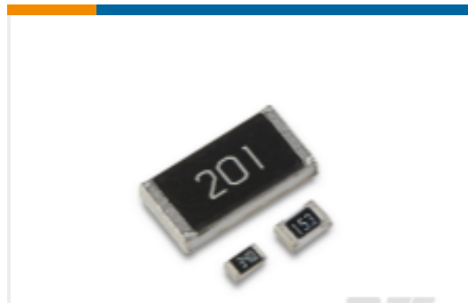
TE Part #1-2176326-9 CRGP 0603 330R 1%