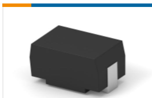
TE Part #5-1676966-5 SMD Power Resistor: 7 Watt, 200-2M Ohm