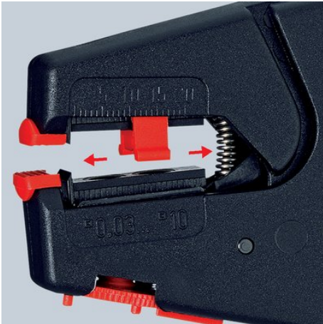
12 40 200: Adjustable length stop