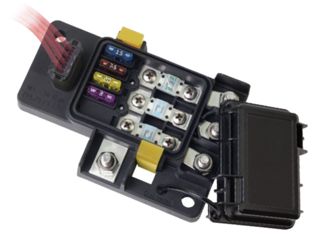
Fuses sold separately