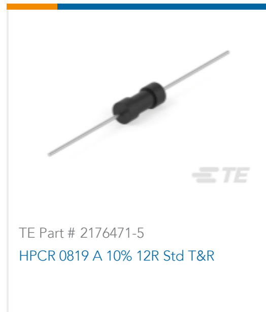
TE Part # 2176471-5 HPCR 0819 A 10% 12R Std T&R