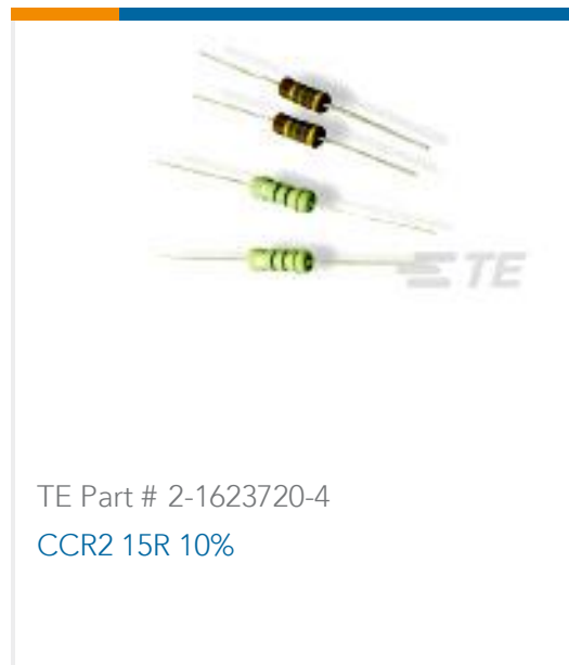
TE Part # 2-1623720-4 CCR2 15R 10%