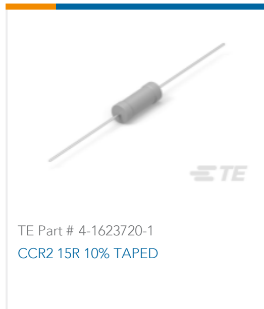
TE Part # 4-1623720-1 CCR2 15R 10% TAPED