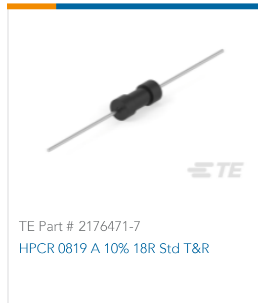
TE Part # 2176471-7 HPCR 0819 A 10% 18R Std T&R