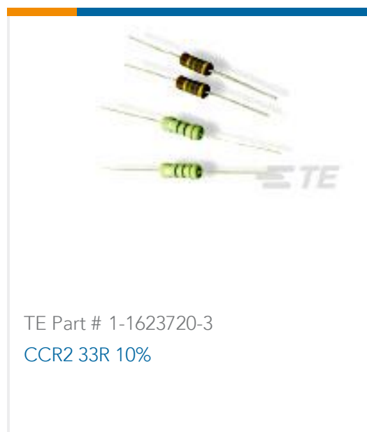
TE Part # 1-1623720-3 CCR2 33R 10%