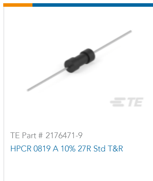
TE Part # 2176471-9 HPCR 0819 A 10% 27R Std T&R