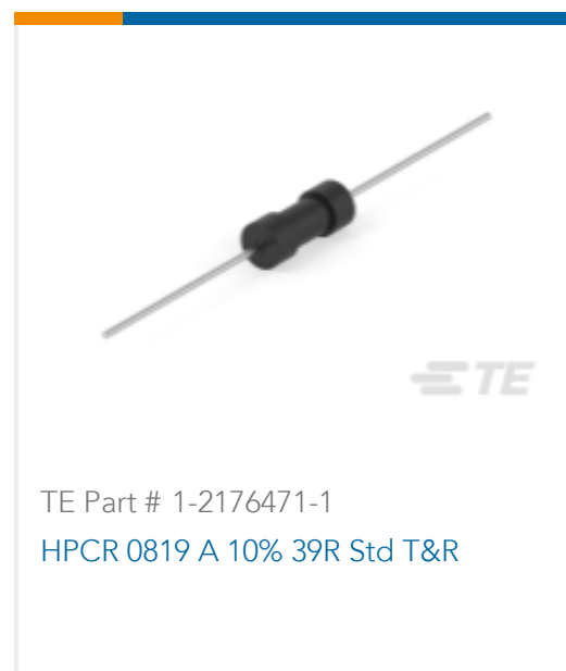
TE Part # 1-2176471-1 HPCR 0819 A 10% 39R Std T&R