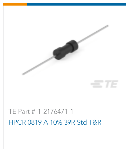
TE Part # 1-2176471-1 HPCR 0819 A 10% 39R Std T&R