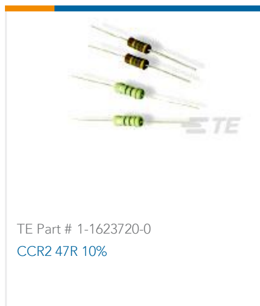
TE Part # 1-1623720-0 CCR2 47R 10%