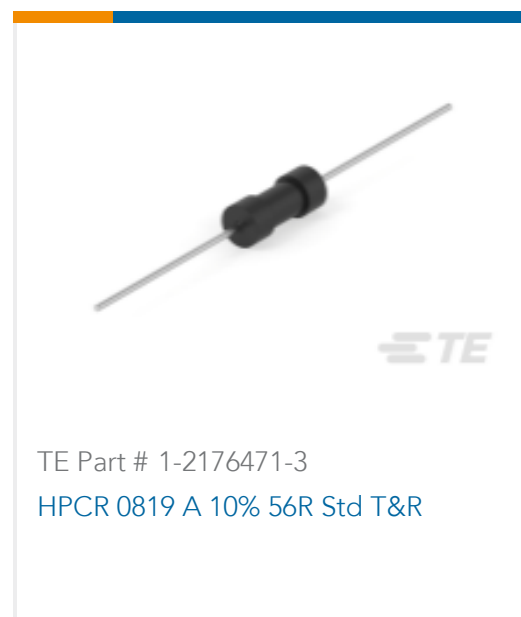
TE Part # 1-2176471-3 HPCR 0819 A 10% 56R Std T&R