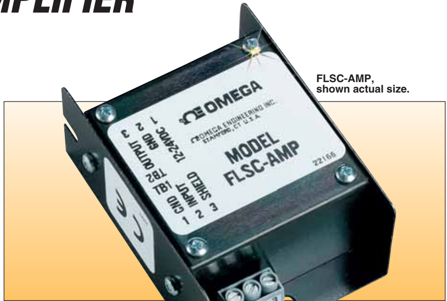
FLSC-AMP, shown actual size.

NOTE: The low voltage line from the magnetic pickup to the FLSC-AMP should be less than 3 m (10') in length, shielded and isolated from relays, solenoids or other sources of electrical noise (let the output line make the long run). If the input is too sensitive, lower the 1.1K input impedance by adding a 220 to 1 Kohm resistor across TB1, pins 1 and 2, to increase noise immunity.