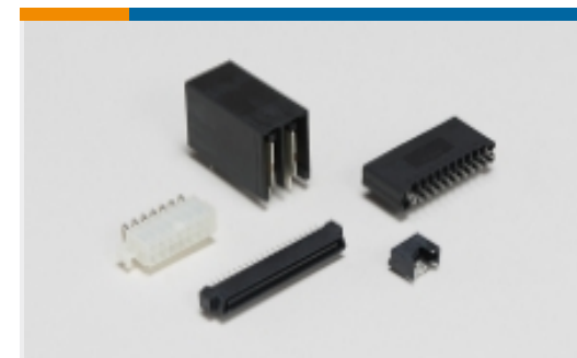
Standard Rectangular Connectors(18)