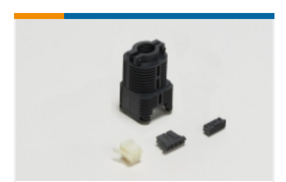
Rectangular Connector Housings(20)