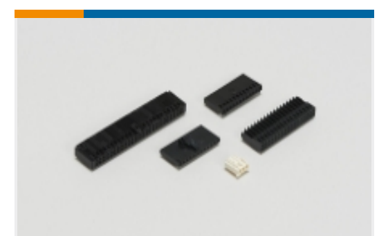
Wire-to-Board Connector Assemblies & Housings(1)