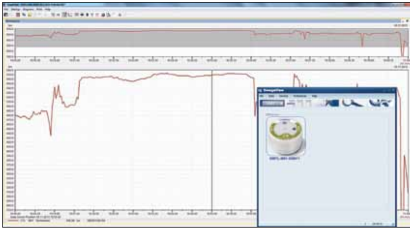
OMYL-SOFT-PLUS graphical display.