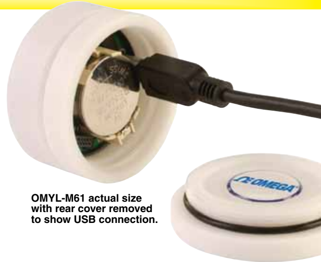
OMYL-M61 actual size with rear cover removed to show USB connection.