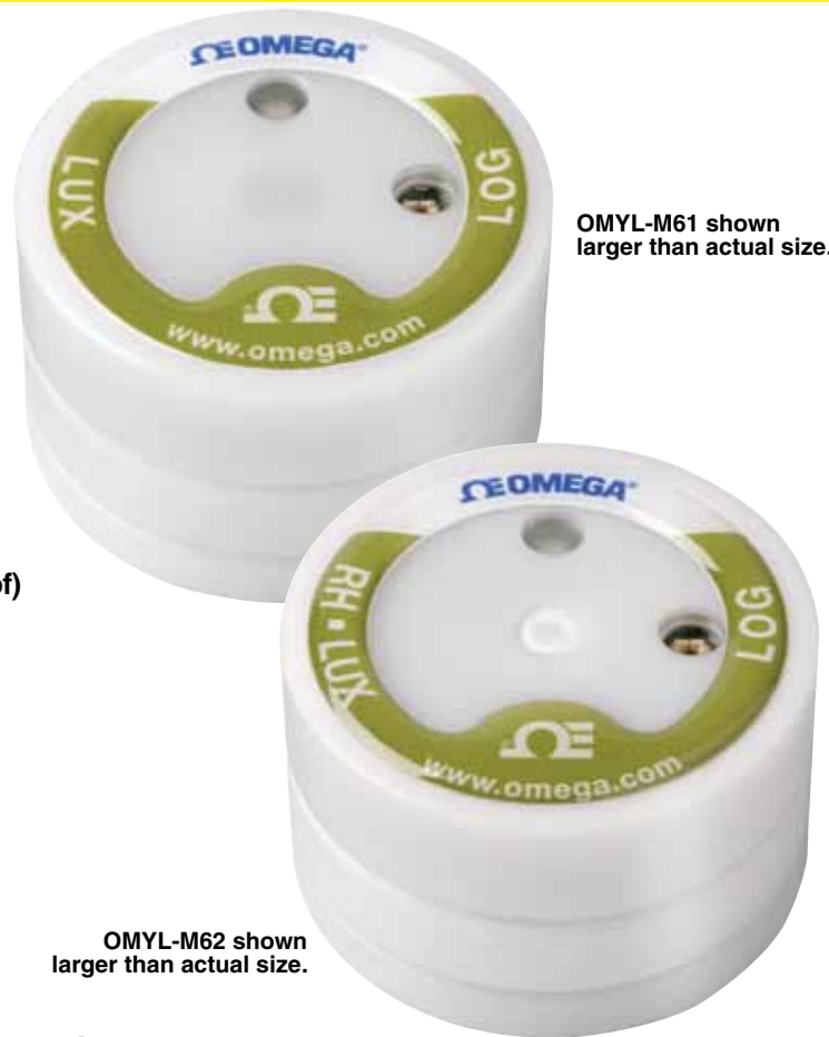
OMYL-M61 shown larger than actual size.

Temperature (OMYL-M62, OMYL-M62-4M Only): -30 to 70°C (-22 to 158°F) with standard battery; -40 to 90°C (-40 to 194°F) with optional high temperature battery