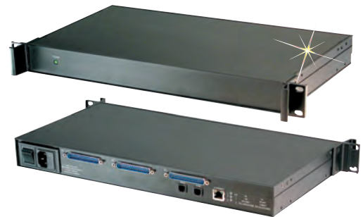
OMB-DAQSCAN-2005, front and back, shown smaller than actual size.