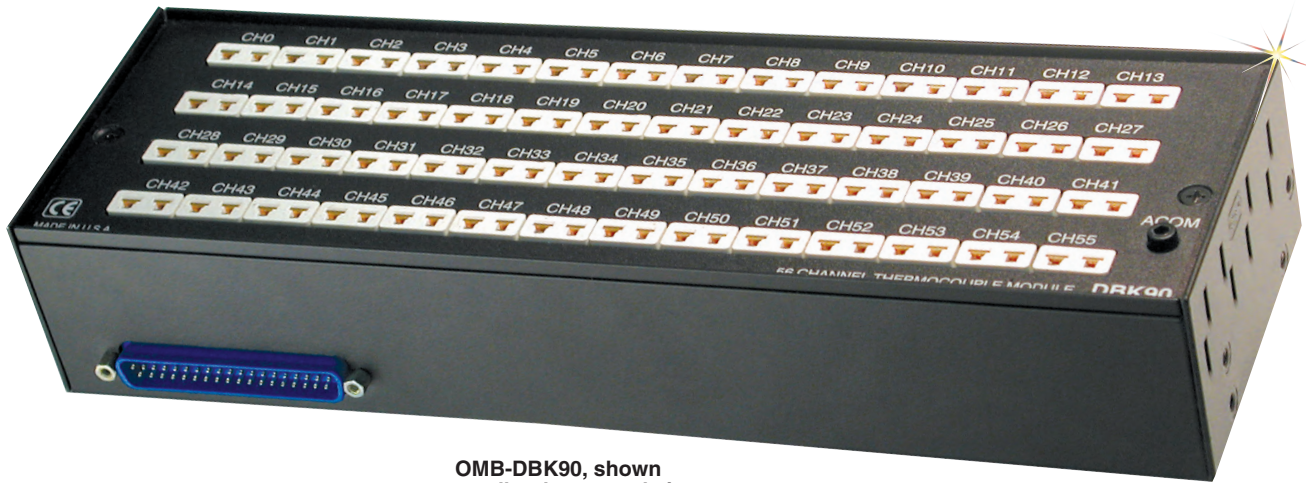
OMB-DBK90, shown smaller than actual size.

5SRTC-TT-K-24-26, 5 pack basic unit. Visit omega.com for more details.