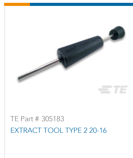
TE Part # 305183 EXTRACT TOOL TYPE 2 20-16