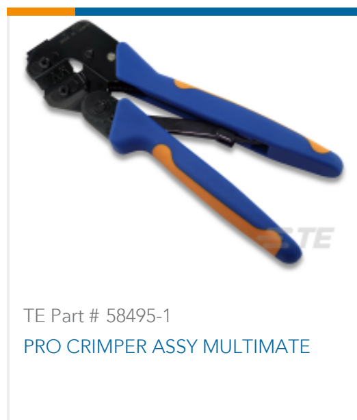
TE Part # 58495-1 PRO CRIMPER ASSY MULTIMATE