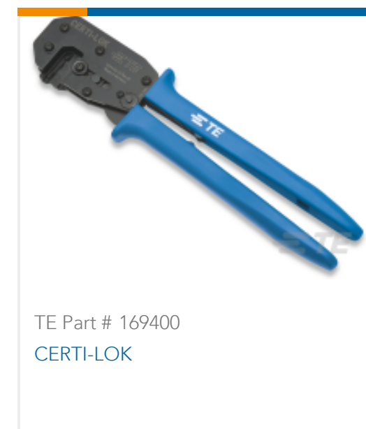
TE Part # 169400 CERTI-LOK