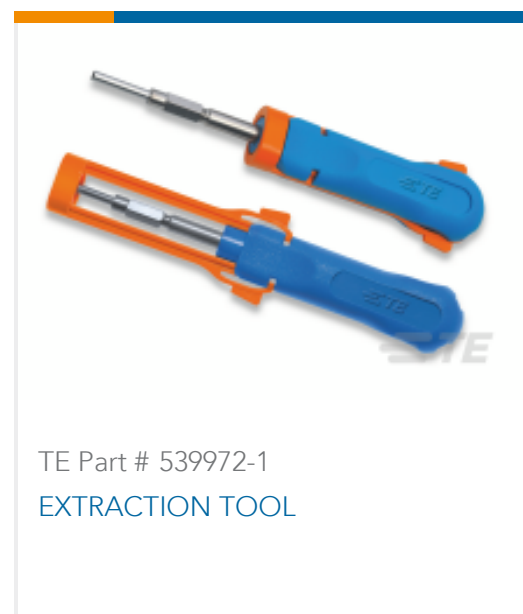
TE Part # 539972-1 EXTRACTION TOOL