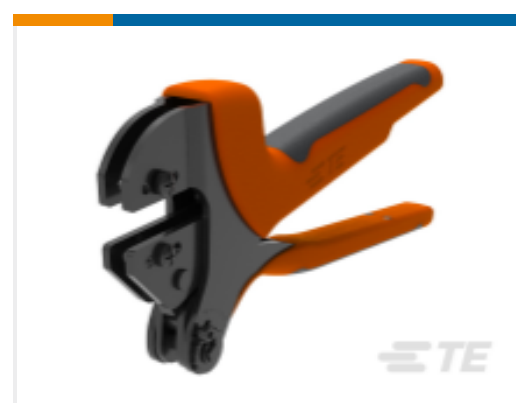
TE Part # 2362810-1 SDE CRIMP HAND TOOL FRAME W /O DIES