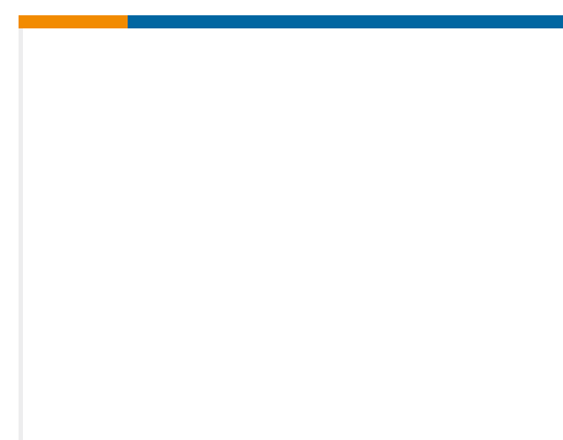
TE Part # 963709-5 STD PW TIMER CONTACT