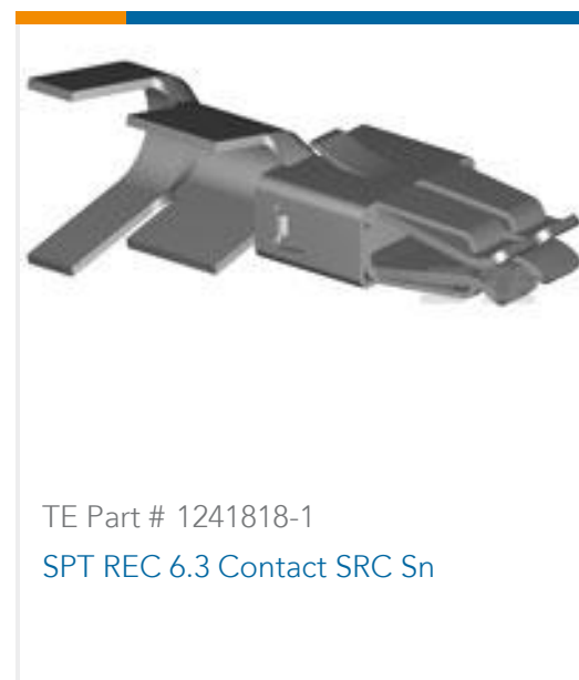
TE Part # 1241818-1 SPT REC 6.3 Contact SRC Sn