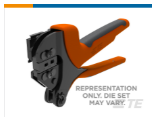
TE Part # 2385410-1 SDE F STND PWR TIMER 4-6mm2 ASSY