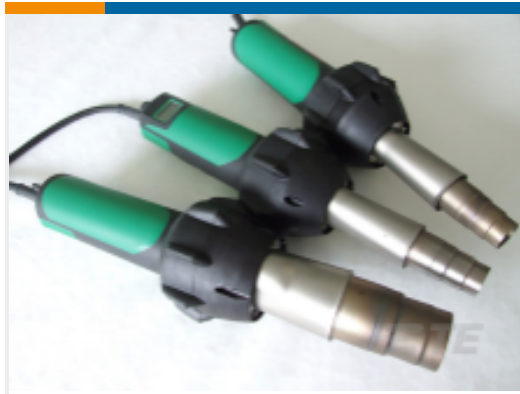
TE Part # EG1118-000 CV1981-ST-120V1600W-US