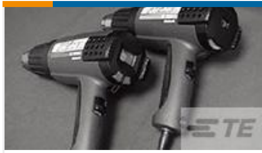
TE Part # CJ2087-000 HL2010E-KIT-120V