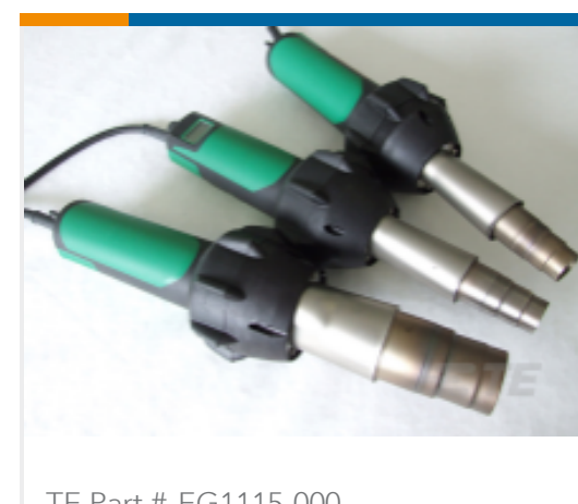
TE Part # EG1115-000 CV1981-ST-230V1600W-CH