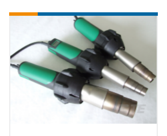
TE Part # EG1118-000 CV1981-ST-120V1600W-US