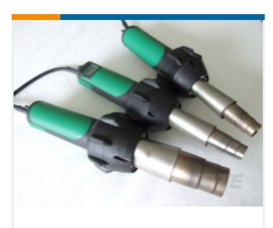
TE Part # EG1116-000 CV1981-ST-230V1600W-UK