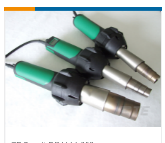
TE Part # EG1114-000 CV1981-ST-230V1600W-EU