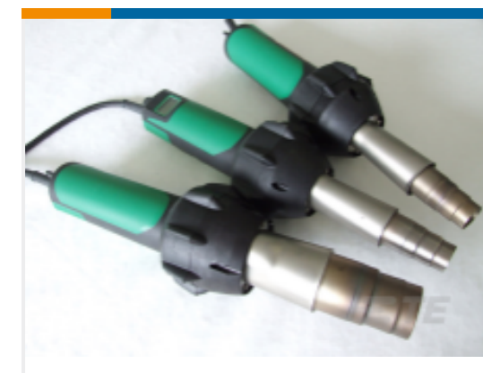
TE Part # EG1120-000 CV1981-ST-120V1600W-UK