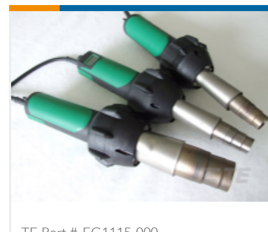
TE Part # EG1115-000 CV1981-ST-230V1600W-CH