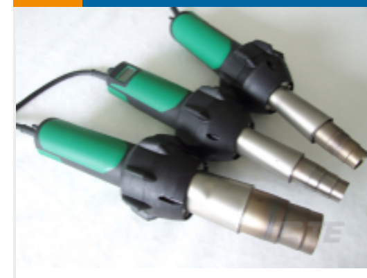
TE Part # EG1120-000 CV1981-ST-120V1600W-UK