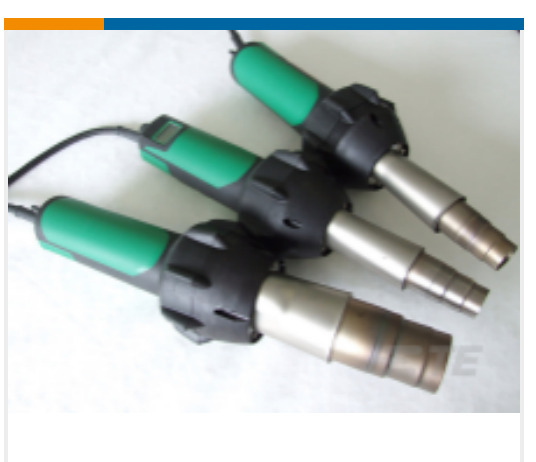
TE Part # EG1114-000 CV1981-ST-230V1600W-EU