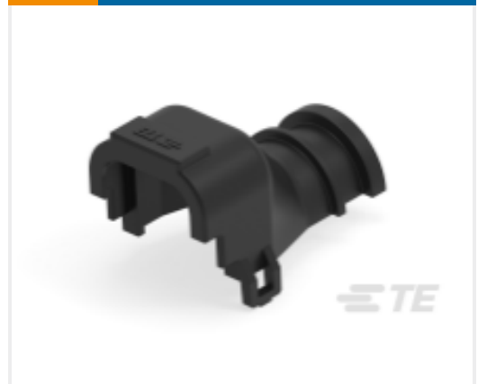
TE Part # CAT-AM78-B128 AMPSEAL Backshells