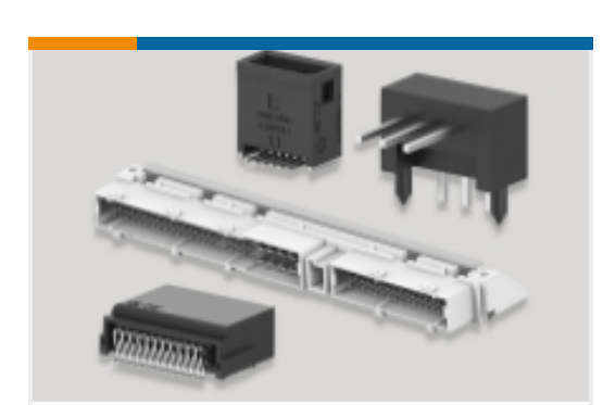
PCB Headers & Receptacles(30)