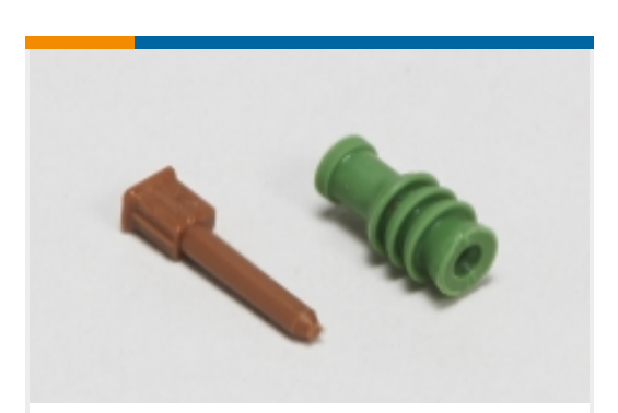
Automotive Seals & Cavity Plugs(1)