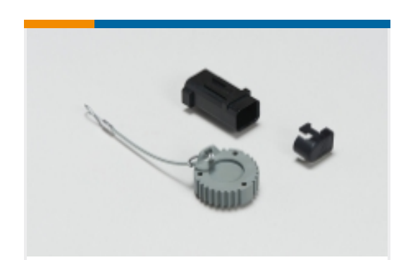
Automotive Connector Caps & Covers (5)