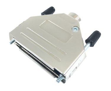
D-Sub Connector with Backshell