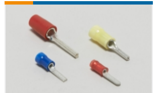
Crimp Wire Pins, Tabs & Ferrules(6)