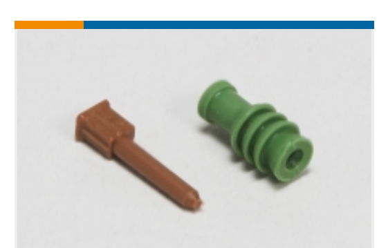
Automotive Seals & Cavity Plugs(4)