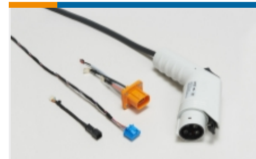
Electric, Hybrid & Fuel Cell Cable Assemblies(48)