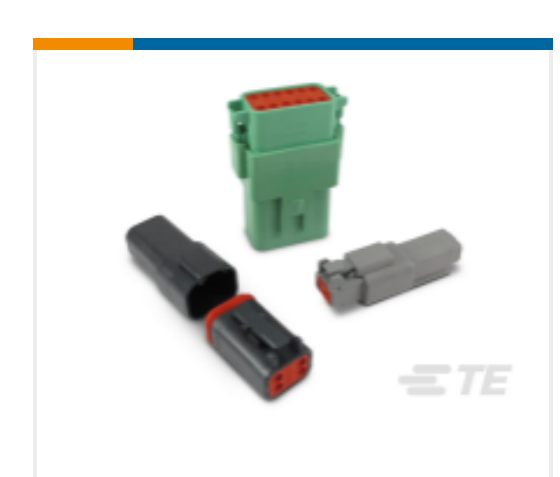
TE Part #DT06-2S DEUTSCH DT Series Housings & Connectors