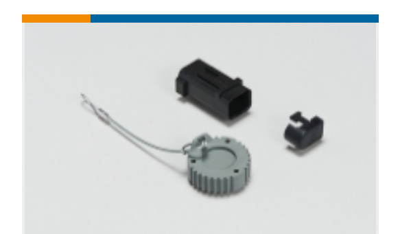
Automotive Connector Caps & Covers