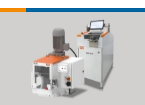
High Voltage Wire Processing Equipment(18)