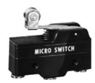
Representative photograph, actual product appearance may vary.