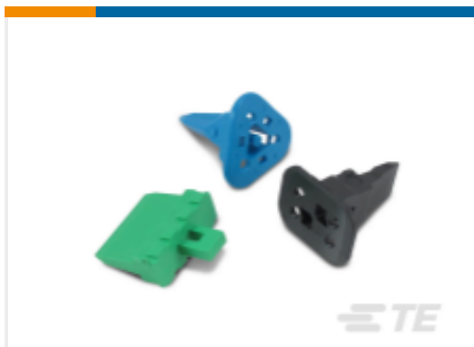
TE Part #W2S DEUTSCH DT Wedgelocks