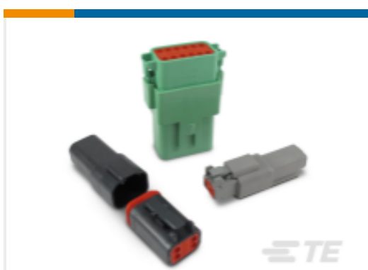
TE Part #DT04-2P DEUTSCH DT Series Housings & Connectors