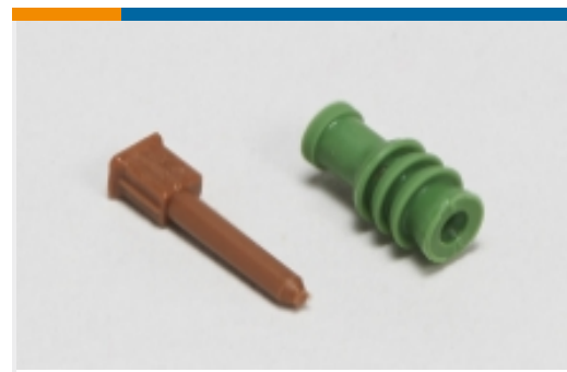
Automotive Seals & Cavity Plugs(3)