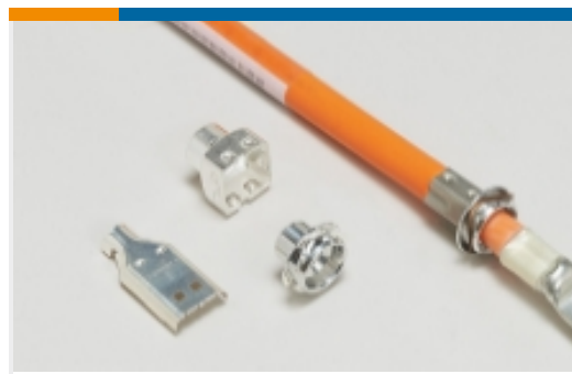
Automotive Connector EMC Shielding (6)