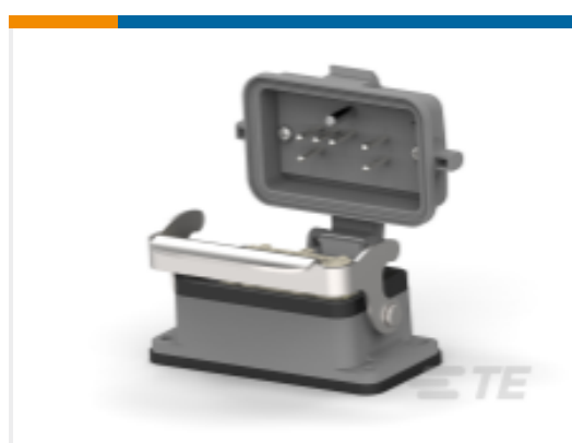
TE Part #T2120100223-000 ZGG-10DST,1-6/3-4/5-10