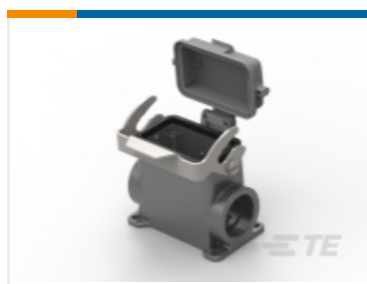
TE Part #T1660103132-000 H10B-SDRH-LB-M32