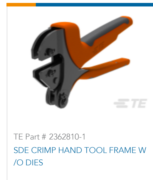
TE Part # 2362810-1 SDE CRIMP HAND TOOL FRAME W /O DIES