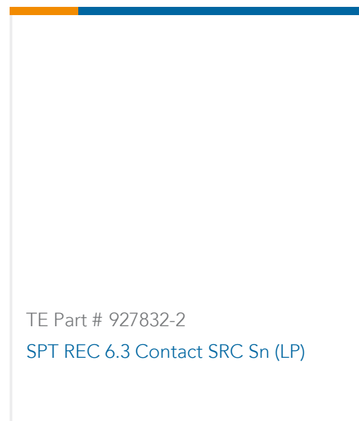
TE Part # 927832-2 SPT REC 6.3 Contact SRC Sn (LP)