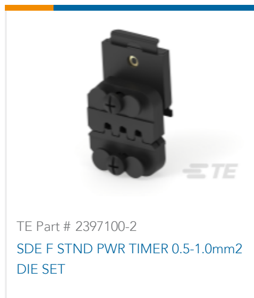
TE Part # 2397100-2 SDE F STND PWR TIMER 0.5-1.0mm2 DIE SET