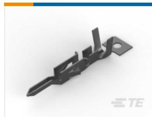
TE Part # 794955-1 VAL-U-LOK PIN BR SN 22-18AWG