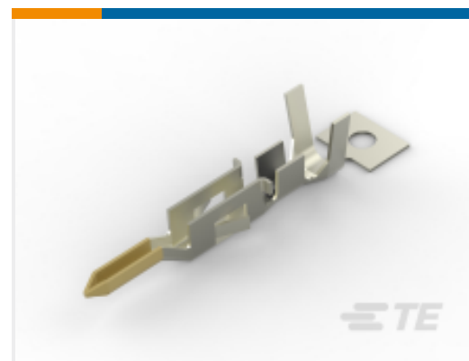
TE Part # 794955-4 VAL-U-LOK PIN PHBZ AU 22-18AWG