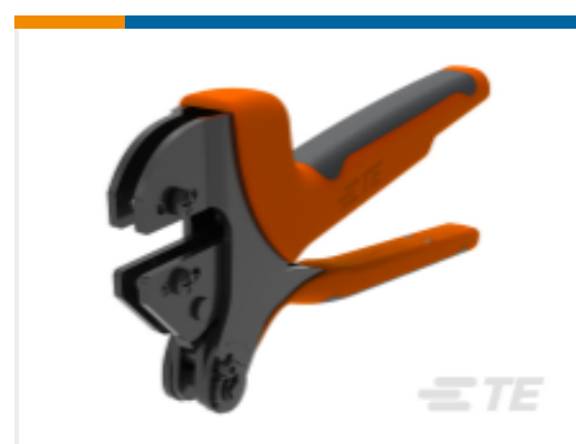
TE Part # 2362810-1 SDE CRIMP HAND TOOL FRAME W /O DIES