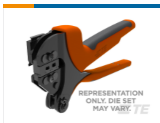
TE Part # 2394165-1 SDE F PIN 22-18 ASSY