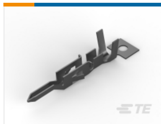
TE Part # 794955-3 VAL-U-LOK PIN PHBZ SN 22-18AWG