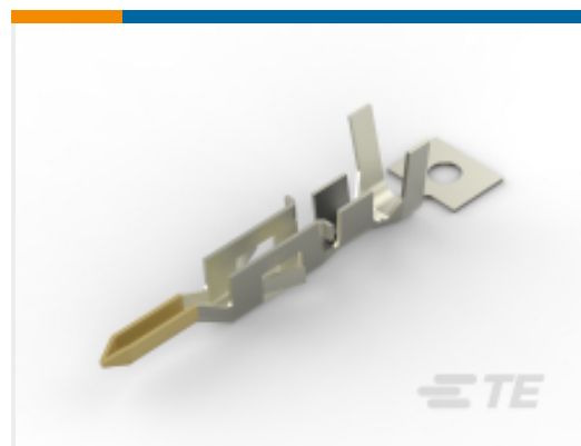
TE Part # 794955-2 VAL-U-LOK PIN BR AU 22-18AWG